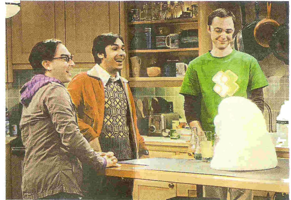
Kunal Nayyar (c) costars with Johnny Galecki (l) and Jim Parsons (r) on "The Big Bang Theory."

For fun, he has played badminton and is a huge cricket fan. And like his TV character, Nayyar admits to having a few "geekish" traits. "I'm a huge 'Star Wars' and 'Lord of the Rings' fan. I played the board game, 'Star Wars Epic